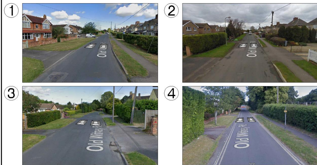
Speed Cushion Locations